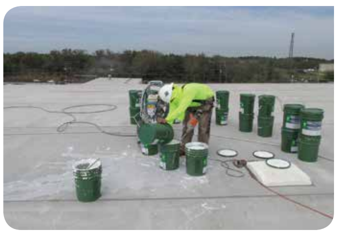
A manufacturing facility in central Florida that houses high-tech lasers was having issues with temperature shifts. Their solution was to hire J.L.K. Caulking and Coating to insulate their 32,000-square-foot (2,973 m²) roof.

"Using a temperature gun, we took readings for the 10 percent of the roof area that received the application of Mascoat WeatherBloc-IC. Those areas consistently had readings of 71, 72, or 73° F [21, 22, or 23° C]. These results were amazing, especially when compared to the readings that we got for the uncoated sections of the roof. Those temperature readings were anywhere from 92 to 95° F [33–35° C]," stated Kushner. The Mascoat WeatherBloc-IC had more than proved that it was a product that could regulate the rooftop temperature and eliminate the need for FINFROCK to recalibrate the lasers every time the outside temperature warmed up.